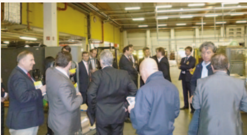
Debriefing after the visit at the Austrian Post - Central Parcel Logistic Centre