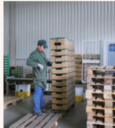
Great stackability with corrugated trays at LGV

Finally, about 30 delegates were given the chance to see the central warehouse facility of REWE in Wiener Neudorf, one of the biggest in Austria (32 000 m 2 and storage space for 32 000 pallets). During the visit, the participants discovered the complexity of REWE logistics. Among other things, visitors saw the fully automatic high-rack warehouse, some sections of the order-picking area, the sorting of products for stores, the preparation of roll-cages and the waste management process.