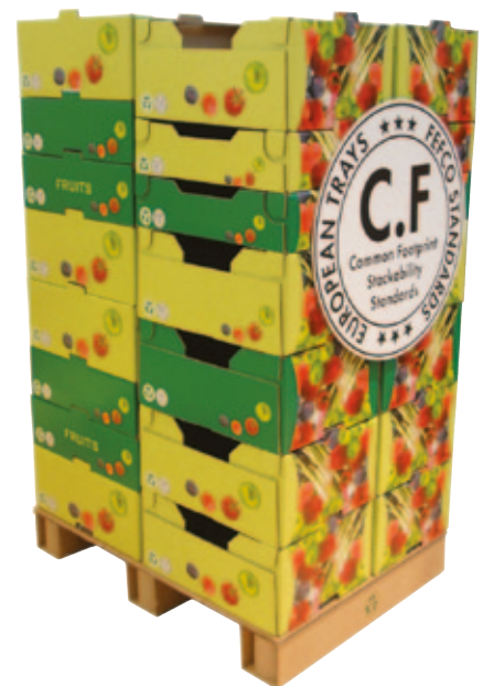
Thanks to its CF standard corrugated can compete!

This hierarchy may however be interpreted with a flexible approach.