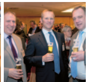
Summit participants had the opportunity to meet each other at the welcome cocktail in the Marriot Hotel Atrium. A good chance to enjoy a drink and meet colleagues and friends old and new! This welcome reception was sponsored by Hamburger Containerboard.