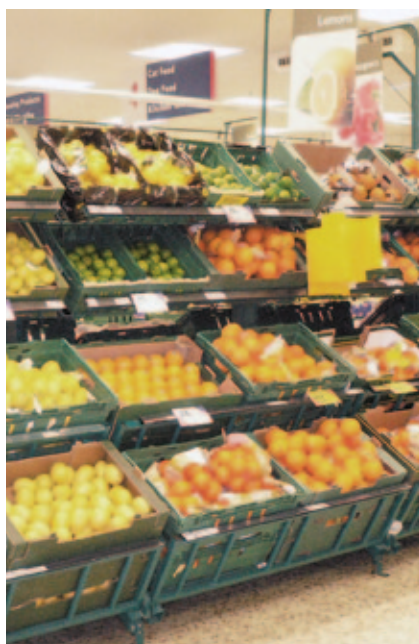
Widespread use of RPC's for produce

In January 2012, Carton Ondulé de France commissioned a study evaluating the comparative economic and environmental advantages of reusable plastic crates and recyclable corrugated cardboard trays.