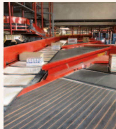
Sorting at REWE central warehouse