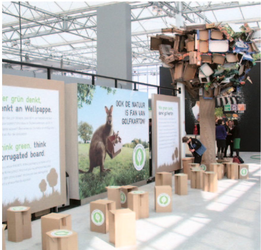
Is there anything that cannot be made from corrugated?