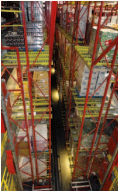
REWE impressive high-rack warehouse