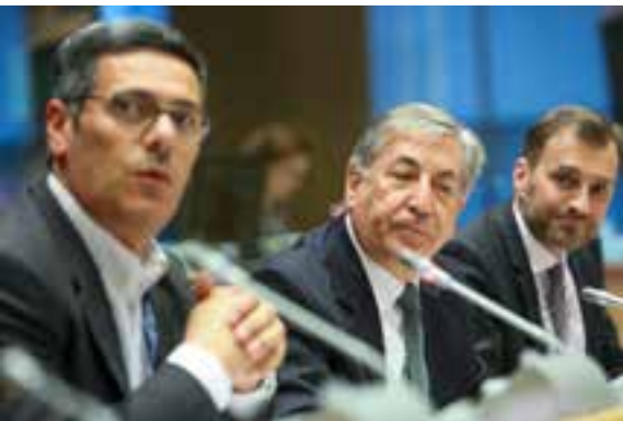
From left to right: Giovanni La Via – Chairman of Environment Committee (EU Parliament), Karmenu Vella – Commissioner responsible for Circular Economy

The people are changing the world of politics in Europe and globally. If we glimpse back, 2016 was full of surprises, like every year, but this time there was something different, something unexpected.