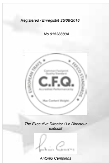
EU trademark certificate of the EUIPO (European Union Intellectual Property Office)

FEFCO is proud to announce that the C.F.Q. (Common Footprint Quality) EU trademark has been officially registered!